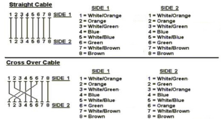
Figure A-1: Straight-Through and Crossover Cable

There are 8 wires on a standard UTP/STP cable and each wire is color-coded. The following shows the pin allocation and color of straight cable and crossover cable connection: